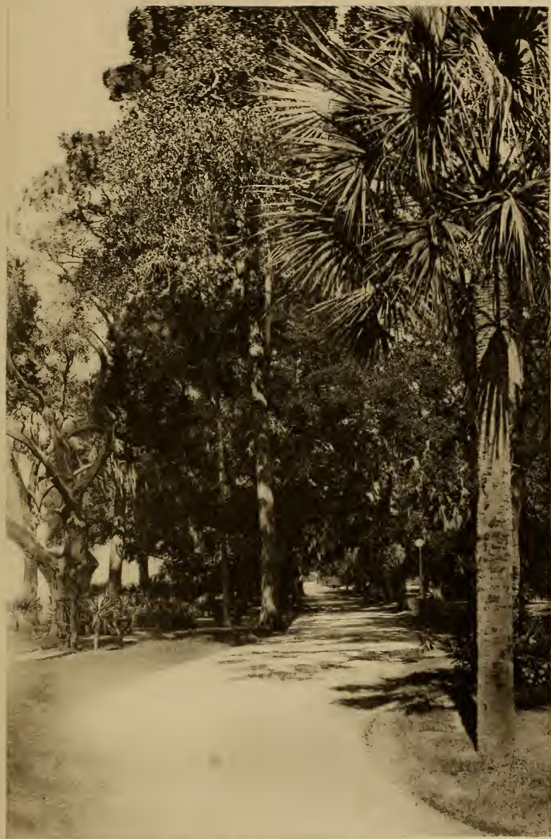
ENCLOSURE OF CLUB GROUNDS